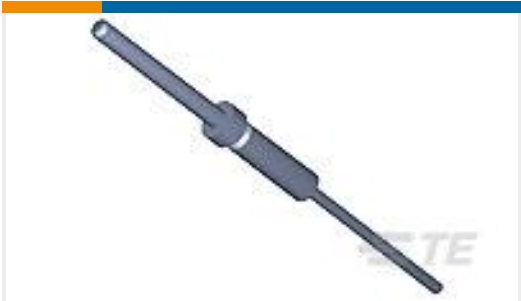
TE Part #1-212565-0 AMPLIMITE, PIN CONT, SZ 20, AU PLTD