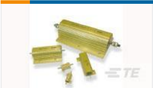
TE Part #6-1625971-8 HSA25 82R 5%