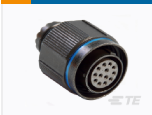
TE Part #YDTS26F25-35PCV001 Straight Plug: D38999, 25-35 Insert, Electroless Nickel Plating