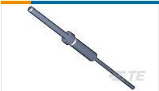
TE Part #207683-2 AMPLIMITE, PIN CONT, SZ 22