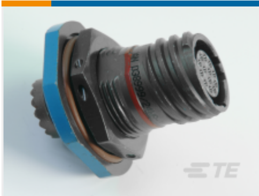
TE Part #YDTS24F25-35SAV001 D38999: Jam Nut, 25-35 Insert, Electroless Nickel Plating