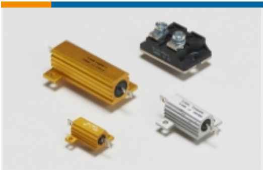
Chassis Mount Resistors(241)